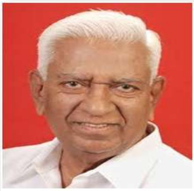
Honourable Sri Vajubhai Vala