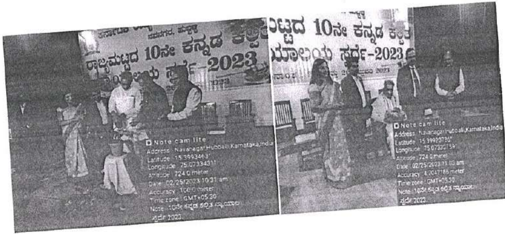
Dignitaries with participants