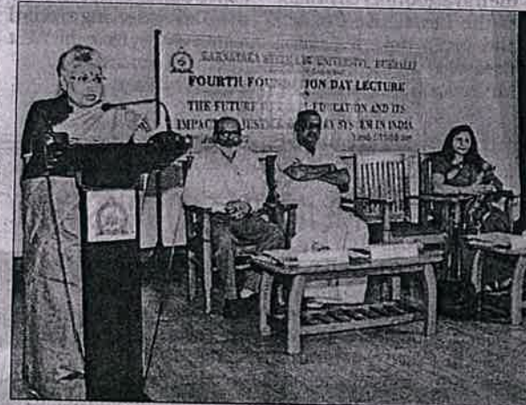
Justice B V Nagarathna delivers lecture at the KSLU at Navanagar in Hubballi on Saturday.

to be given a direction in all areas of conflict inherent in a complex society and economy. Only then will they be able to recognise and understand the socio-legal challenges of society and be able to seek resolution through the method of social engineering. Legal education should be able to meet the ever-growing demands