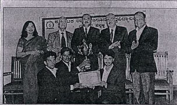
Students of SDM Law College in Mangaluru, who won the championship trophy of State-level Kannada moot court competition organised by the KSLU in Hubballi, along with the dignitaries.