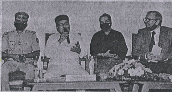
Governor Thawarchand Gehlot (second from left) interacting with students at Karnataka State Law University in Hubballi on Monday.

Terming KSLU as the best among legal institutions in the country, he said that several of the alumni of the un-