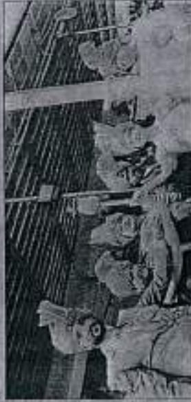
Dignitaries hold sports torch at the inauguration of the KSLU inter-collegiate athletic meet at R N Shetty Stadium in Dharmavaram on Friday.

DECCAN HERALD 3 Saturday, February 24, 2016