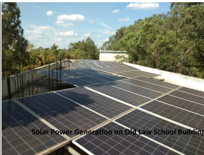
Solar Power Generation on Old Law School Building and Ladies Hostel

Power Purchase Agreement has been made for roof top solar PV plant installed by HESCOM on Ladies Hostel building and Old Law School Building with Net Metering Arrangement on 19-09-2019 between HESCOM and Registrar, Karnataka State Law University, Navanagar, Hubli. (Copy of the Agreement enclosed). This agreement shall be in force for a period of 25 years from the date of commissioning of the SRTPV system. The HESCOM shall account for the net exported energy at the average pooled power cost as notified by the commission annually for the term of the agreement. HESCOM shall issue montly electricity bill for the net metered Energy on the scheduled date of meter reading.