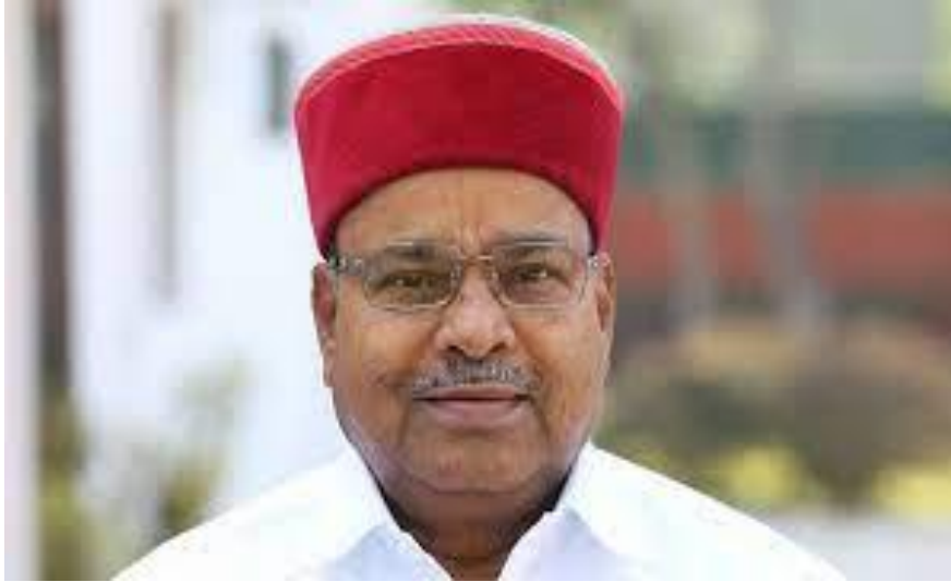
His Excellency Sri. Thawar Chand Gehlot