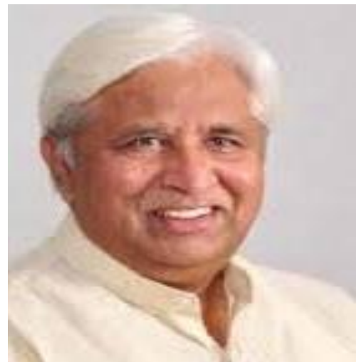
Sri. H. K. Patil

Hon'ble Minister for Law, Justice and Human Rights Department. Government of Karnataka