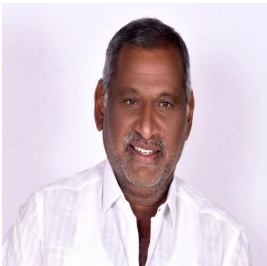
Sri. J.C. Madhuswamy

Hon'ble Minister for Law, Department. Government of Karnataka