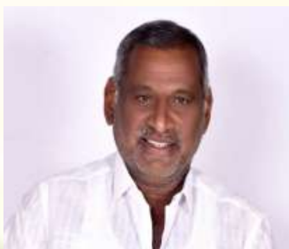
Sri. J.C. Madhuswamy Hon'ble Minister for Law, Parliamentary Affairs & Legislation