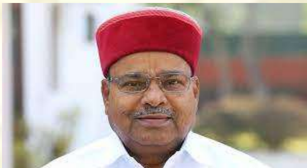
Hon'ble Sri. Thawar Chand Gehlot Governor of Karnataka