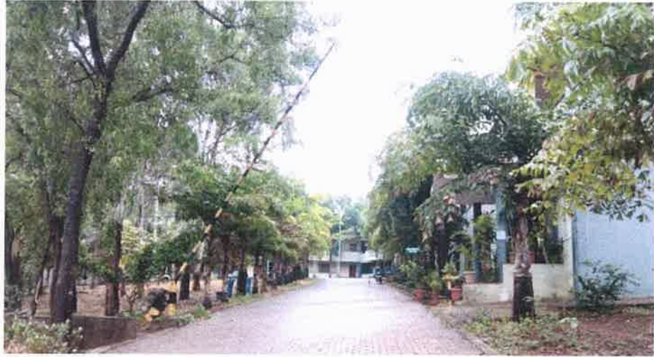
No entry to the Students Vehicles beyond this point