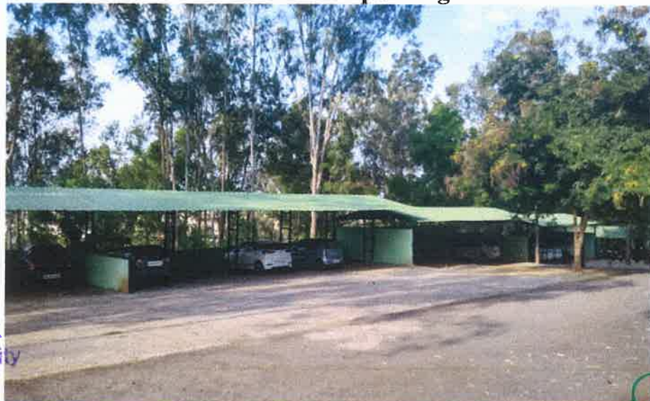
Four Wheeler parking