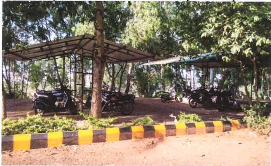
Two wheeler parking