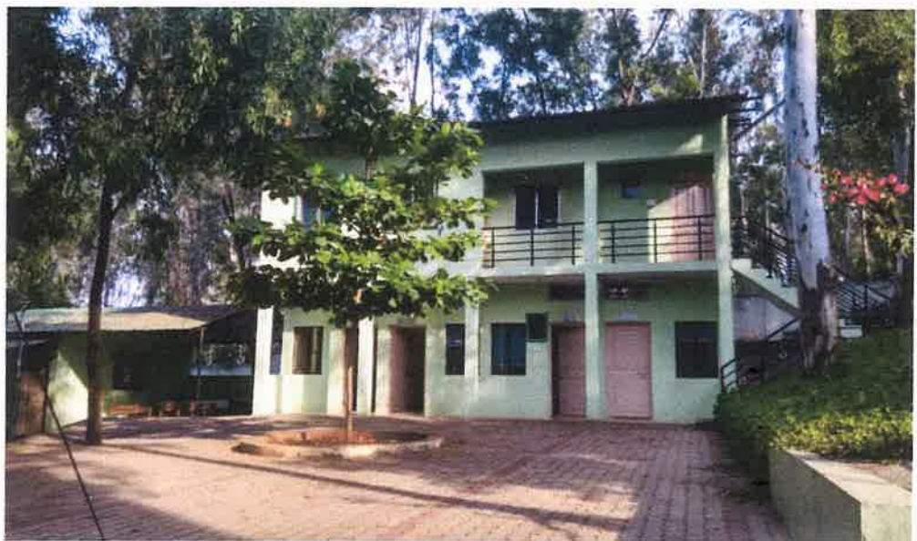
Plantations inside the campus