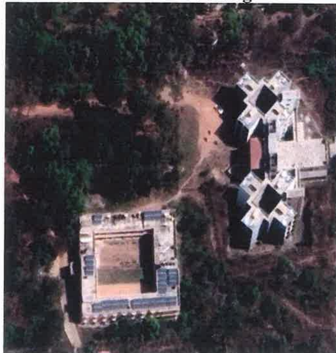
Boy's and Girl's Hostel

[Signature] IQAC COORDINATOR Karnataka State Law University Hubballi-25.