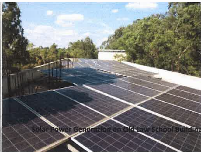
Solar Power Generation on Old Law School Building and Ladies Hostel

Power Purchase Agreement has been made for roof top solar PV plant installed by HESCOM on Ladies Hostel building and Old Law School Building with Net Metering Arrangement on 19-09-2019 between HESCOM and Registrar, Karnataka State Law University, Navanagar, Hubli. (Copy of the Agreement enclosed). This agreement shall be in force for a period of 25 years from the date of commissioning of the SRTPV system. The HESCOM shall account for the net exported energy at the average pooled power cost as notified by the commission annually for the term of the agreement. HESCOM shall issue montly electricity bill for the net metered Energy on the scheduled date of meter reading.