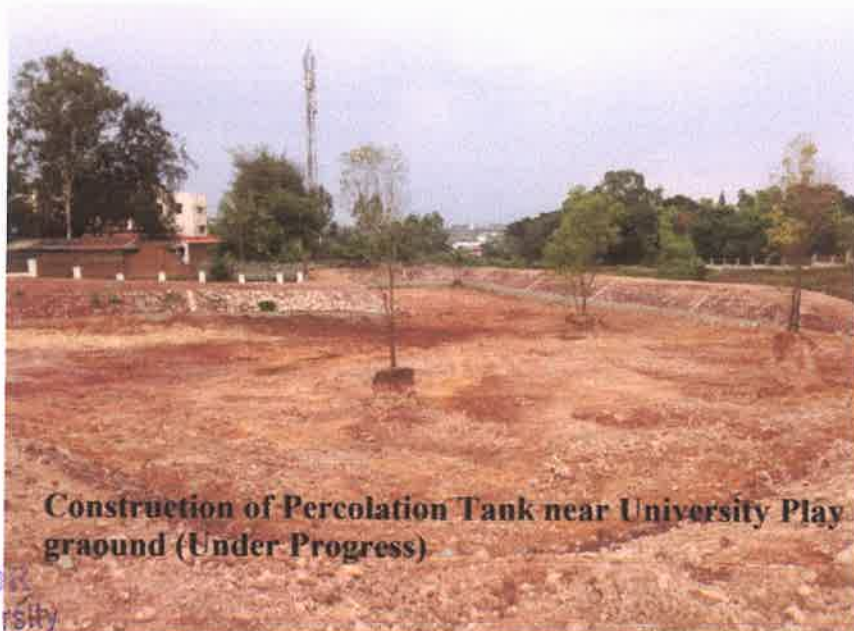
Construction of Percolation Tank near University Play ground (Under Progress)

Construction of Percolation tank to recharge the ground water is under progress Near University Play Ground by Minor Irrigation Department