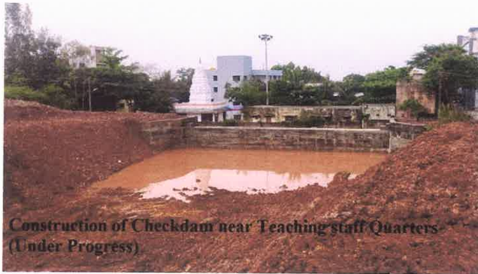
Construction of Checkdam near Teaching staff Quarters (Under Progress)

Construction of Check dam to store the Rain water is under progress near Teaching Staff Quarter's Building by Minor Irrigation Department