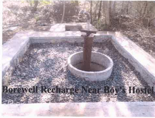
Borewell Recharge Near Boy's Hostel